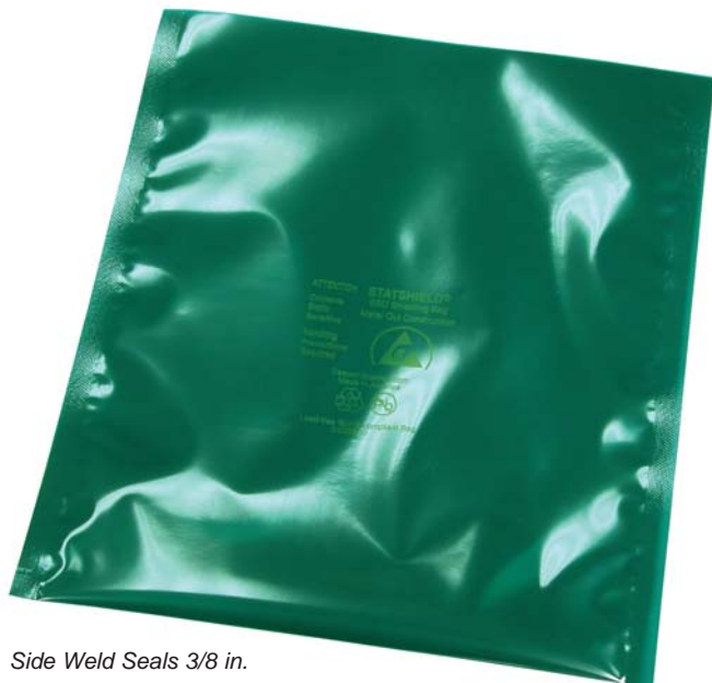
Side Weld Seals 3/8 in.

Proprietary film - available only from Desco Industries Inc.